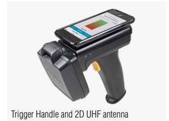
Trigger Handle and 2D UHF antenna