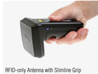
RFID-only Antenna with Slimline Grip