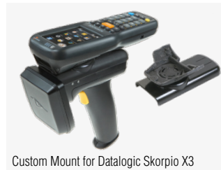
Custom Mount for Datalogic Skorpion X3